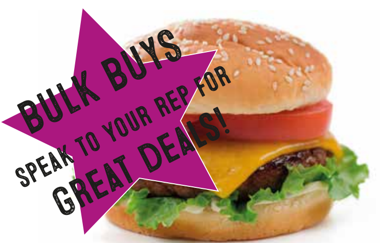
Big Al's Cooked Quarter Pounder x 48 Maw 90% Burgers x 48 Paragon Steak Burgers 20z,40z, 60z & 80z